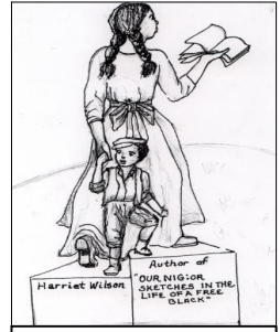
The Harriet E. Wilson Memorial, Milford, NH